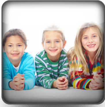
Will they be racing to the top soon?

The Federal Government began giving land grants to build schools back in the late 1700s. In the 1800s Congress granted surplus funds to states for public education. Into the 1900s colleges were receiving grants and the GI Bill was a boon to soldiers returning from war.